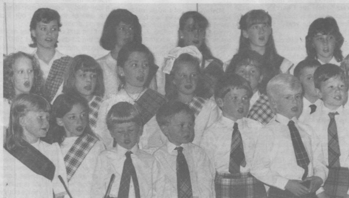
SCOTTISH CHORUS—Boys in kilts and girls in white dresses and tartan sashes sing at Sabbath services in Glasgow, Scotland, July 23.