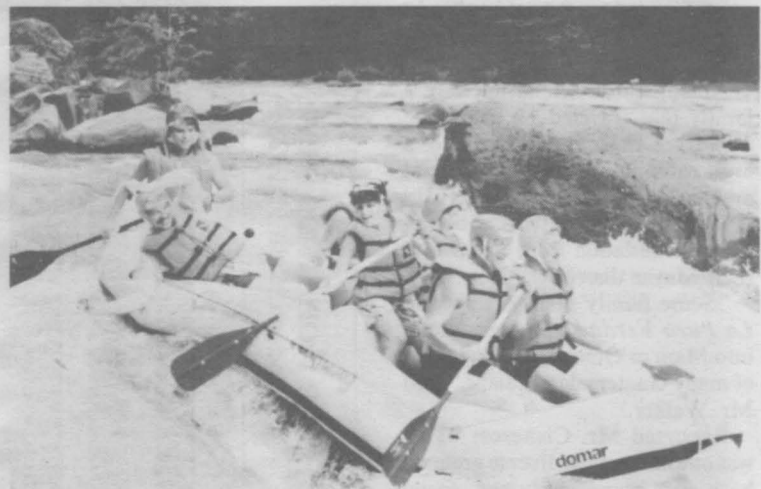
ROUGH AND READY FOR RIVER RAFTING —Members from the Clarksville, Tenn., and Bowling Green, Ky., churches, go whitewater rafting June 19. The five-mile trip took place on the Ocoee River.